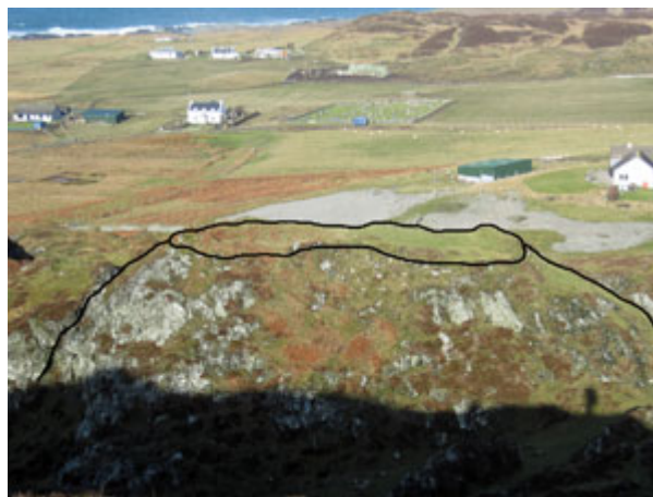
Dùn Meadhonach NR 365947

Technical progress is very good and a mock-up version has been seen and approved. There was quite a debate as to a suitable title but eventually it was agreed to call it The Colonsay App. Most people will download the facility (which is to be free of charge) via a link from the website of some local business or from the community site, but there may be a few people who look for it via an online AppStore so the name might be important. It was noticed that some competitors have chosen rather obscure names, so perhaps Colonsay will gain some traction!