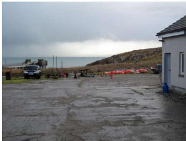
Proposed hut-site, behind buoys

A shore facility is to be built for showers, wet-gear, refreshment etc., in the rough ground near the Pantry which was occupied by the team who built the linkspan (or some other recent project). There will be no industrial activity - all feedstuffs and stock movements will take place at the farm itself, where there is to be a permanent barge facility. The harbour may become a bit busier, to accommodate an 18m landing-craft, plus a 10m. RIB and two wee 6m RIBs.