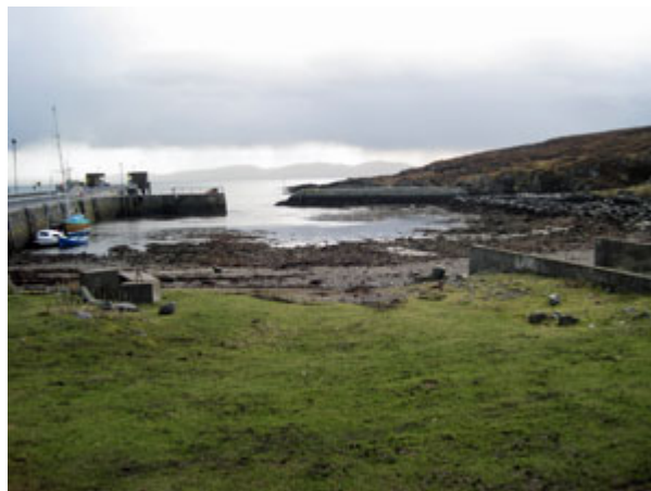
The mole (breakwater) used to be the berth for the packet, much the same size as the 18m. Marine Harvest landing-craft